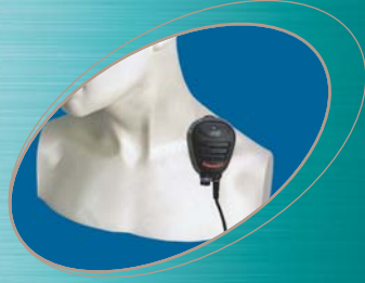
■ CMP750 ▲ CMP950