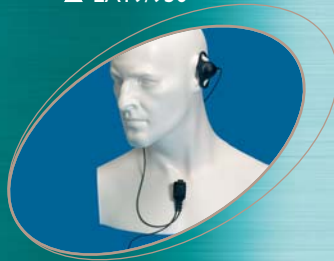
■ EA12/750 ▲ EA12/950