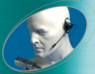
■ EA19/750 ▲ EA19/950