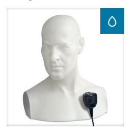
CMP/DXS - simple version CMP/DXE - with earpiece socket Heavy duty speaker microphone